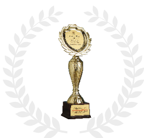
The Best Heritage Bridal Jewellery - Times Retail Icons 2018 -