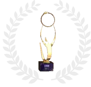
Temple Jewellery Of The Year IJ Jewellers Choice Design Awards 2018