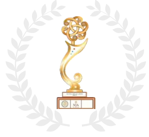
Sterling Silver Artefact Award 2021

Visit Kalasha For Exclusive Jewellery In Diamond | Jadau | Gold | Platinum | Silver Banjara Hills, Hyderabad | MG Road, Vijayawada | Jayanagar, Bengaluru