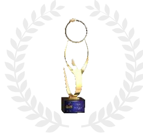
The Best Ring Design Award 2020