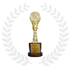
Store Of The Year 2017 By UBM