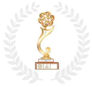
Sterling Silver Artefact Award 2021

Visit Kalasha For Exclusive Jewellery In Diamond | Jadau | Gold | Platinum | Silver Banjara Hills, Hyderabad | MG Road, Vijayawada | Jayanagar, Bengaluru