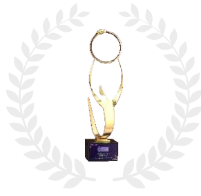
Temple Jewellery Of The Year IJ Jewellers Choice Design Awards 2018