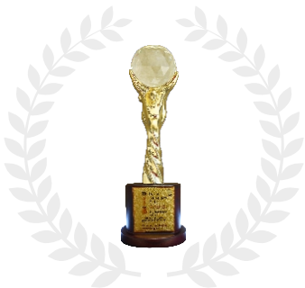
Store Of The Year 2017 By UBM