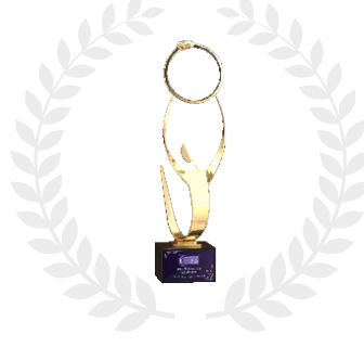
Temple Jewellery Of The Year IJ Jewellers Choice Design Awards 2018