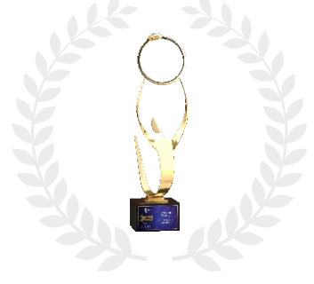
The Best Ring Design Award 2020

Visit Kalasha For Exclusive Jewellery In Diamond | Jadau | Gold | Platinum | Silver Banjara Hills, Hyderabad | MG Road, Vijayawada | Jayanagar, Bengaluru