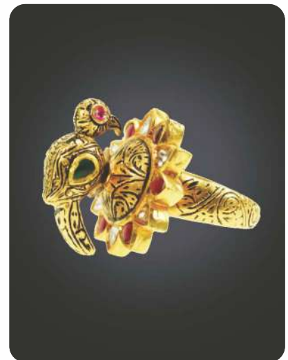
Available exclusively at Kalasha Fine Jewels

Huma Jewellery by Kalasha: Inspired by the Huma bird, we made a royal ring in pure gold carved in Kundan technique, studded with rubies, emeralds and polki flat diamonds. It is a 3-Dimensional bird ring with excellent engraving work all over.