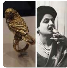
Maharani Sita Devi of Baroda wearing Huma bird ring