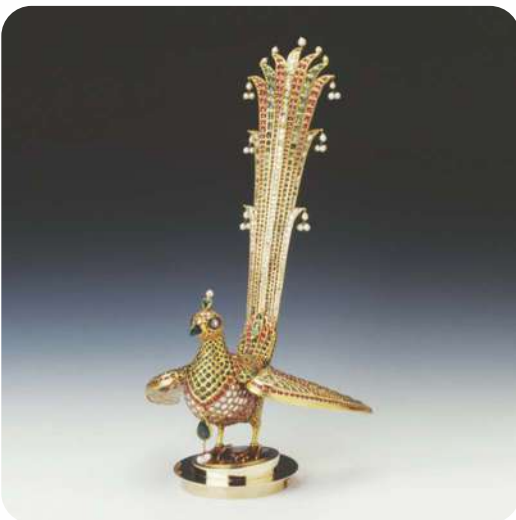
Huma bird on the canopy of Tippu Sulthan's throne

Huma Jewellery by Kalasha: Inspired by the Huma bird, we made a royal ring in pure gold carved in Kundan technique, studded with rubies, emeralds and polki flat diamonds. It is a 3-Dimensional bird ring with excellent engraving work all over.