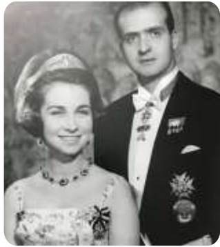
Princess Sophia is wearing one of the two strands of the Medallion necklace in Cabochon Rubies and Diamonds.

It was one of the greatest parades of jewels and gems ever witnessed in the Annals of high society. On the evening of May 13, 1962, the Royal Palace in Athens became a Showcase for Medallion necklace worn by Princess Sophia, daughter of King Paul and Queen Frederica. That night, Princess Sophia wore jewels among her wedding gifts. Sparkling in her hair were the diamond and pear-shaped pearls of an antique tiara given to her by her parents-in-law, the Count and Countess of Barcelona. On her neck, she wore a garland of foliage and roses set entirely with diamonds.