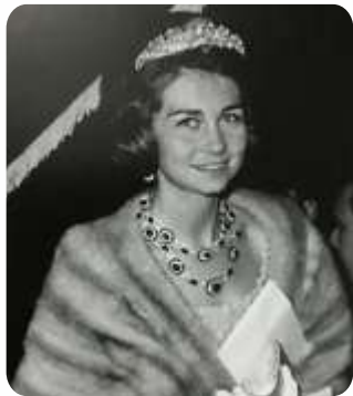
Queen Sophia wearing complete Medallion Necklace.

Medallion Necklace Available At Kalasha Fine Jewels