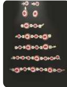
Some of the detached elements of the Medallion Necklace which may be transformed as one long necklace or two shorter necklaces

Each motif thus formed an oval medallion and the medallion were linked by foliage motifs in diamonds and by other simpler medallions, composed of oval cabochons surrounded by a single row of diamonds. The double row of medallion followed the curve of the gown's low neckline, and was fastened at the back of the throat by a garland of foliage in diamonds.