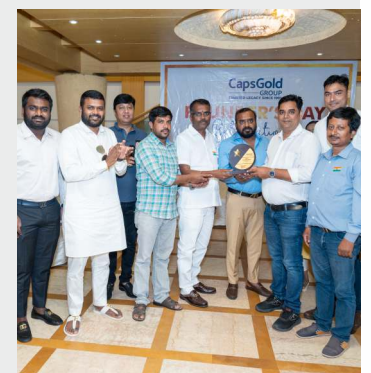
Synergic Force of The Year - Orders & Production Department -