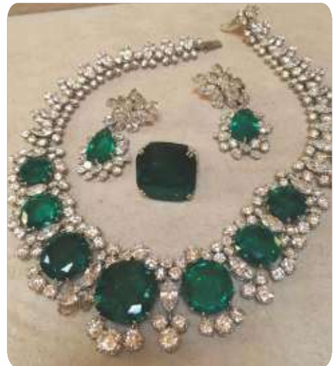
Seven Wonders Necklace with earrings and ring set.

As memories of the war faded into the past, a reconstructed Italy began to flourish during 1950’s and was seen booming by 1960’s. Life had become easier; the American ‘comfort lifestyle’ had made its way to Europe. By 1962 an Italian style in jewellery making had started emerging. As Italy launched its own style of jewellery designs, that was the time where Seven Wonders necklace design came into existence and became very much popular, representing seven stones around the neck as Seven Wonders, a perfect name for an elegant jewel worn by women.