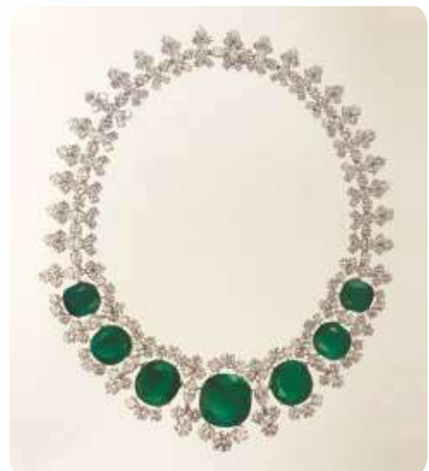
Seven Wonders Necklace (1961) - Platinum with emeralds 39.7x4cm Heritage Collection