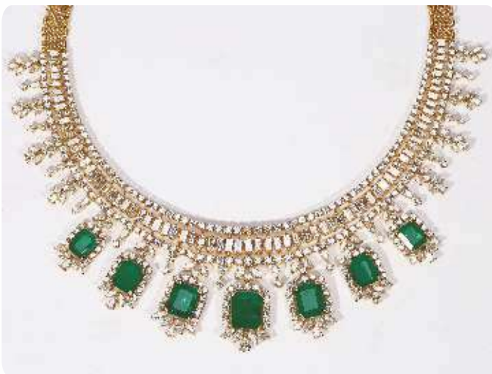
Seven Wonders Necklace available at Kalasha Fine Jewels