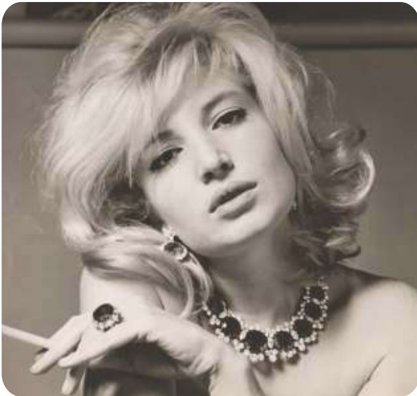
Monica Vitti from 1965, wearing “Seven Wonders” necklace crafted in platinum ,emeralds and diamonds

Even when gemstone combinations continued to follow the conventional traditions of Paris, the jewels relied on tighter arrangements, thus achieving smooth counters with bolder and more compact designs. This style is exemplified in the magnificent emerald and diamond necklace nicknamed the ‘Seven Wonders’. Instead of using the marquise cut, pear-shaped and brilliant cut diamonds commonly found in Parisian jewels, the necklace was studded with round, brilliant-cut trefoil motifs to trim the piece.