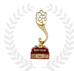
Sterling Silver Artefact Award 2021