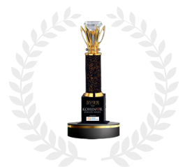
"Leading Legacy Jewellery Store of The Year" Kohinoor Award 2023