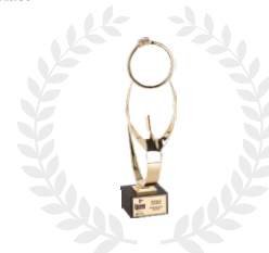
Best Statement Jewellery by IJ Design Awards 2021

Visit Kalasha For Exclusive Jewellery In Diamond | Jadau | Gold | Platinum | Silver Banjara Hills, Hyderabad | MG Road, Vijayawada | Jayanagar, Bengaluru