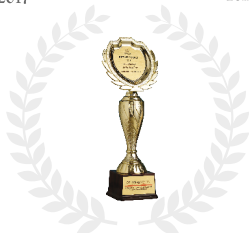
The Best Heritage Bridal Jewellery - Times Retail Icons 2018 -