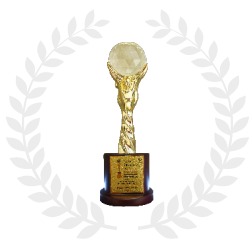
Store Of The Year 2017 By UBM