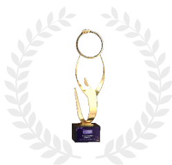
Temple Jewellery Of The Year IJ Jewellers Choice Design Awards 2018