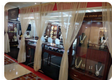
KALASHA @ Jewels Exotica, Bng.