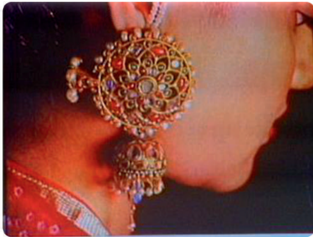
Karanphool Jhumka during the Moghul period

This old Karanphool Jhumka is from Rajasthan (Karanphool meaning a flower for the ear). It is set with uncut diamonds, pearls and cabochon rubies. Two strands of pearls are taken around the ear to support the weight of the jewel. The projection at the rear is also for the purpose of attaching it to the hair to minimise the weight on the ear.