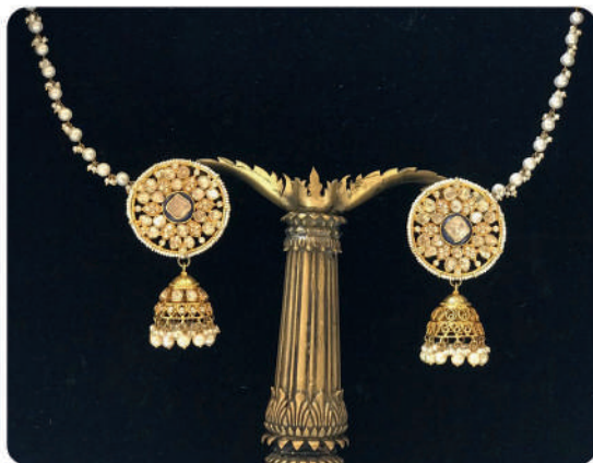
Karanphool Jhumka at Kalasha Fine Jewels Price :2,20,000 INR Gross Weight. 44.92

The most popular jewel for the ear in the north has been the Karanphool, with the flower motif in the centre of the ornament. The Jhumka in the shape of a bell has also been separately worn. It was only during the Moghul period, however, that the Karanphool Jhumka evolved as a single jewel for the ear, each region having its own special embellishment added to the basic design.