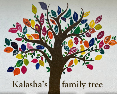
Kalasha's family tree